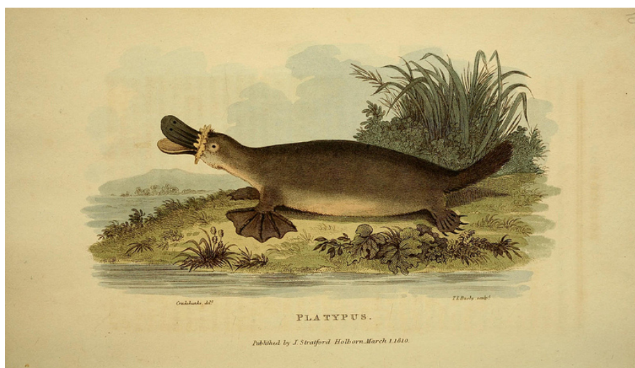
Platypus ( Ornithorhynchus anatinus ). Published in Arcana, or, The museum of natural history, 1811. License: CC: BY-NC-SA. Biodiversity Heritage Library Flickr page .