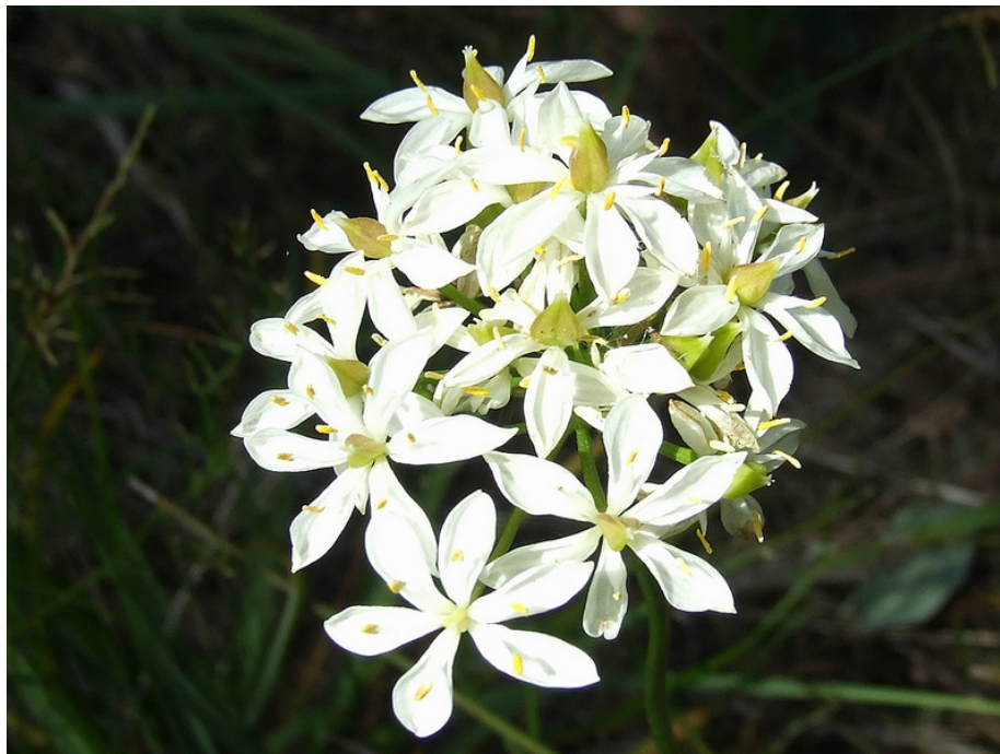
Milkmaids ( Burchardia congesta).