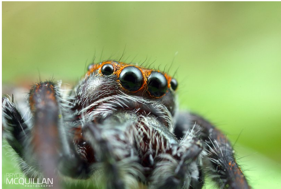
Polkadot jumping spider ( Opisthoncus polyphemus ). Photograph copyright Bryce McQuillan. Used with permission. Bryce McQuillan Flickr page .

has released his photos under the Creative Commons Attribution-Non Commercial-Share Alike license.