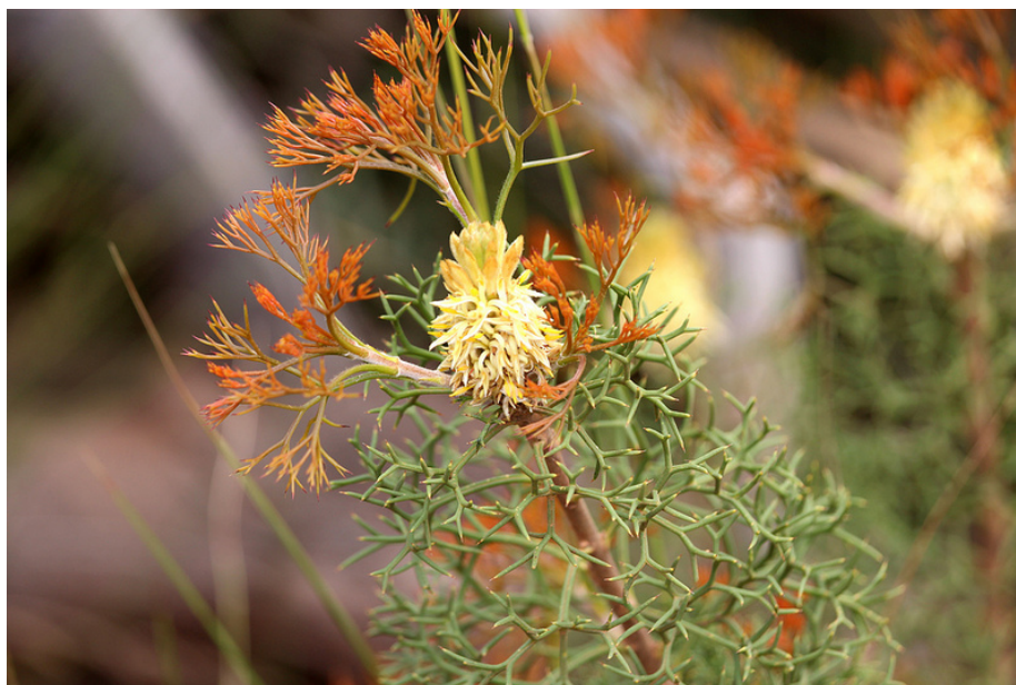
Kangaroo Island Conesticks ( Petrophile multisecta ). Photograph by Arthur Chapman. License: CC: BY-NC-SA. Arthur Chapman Flickr page .